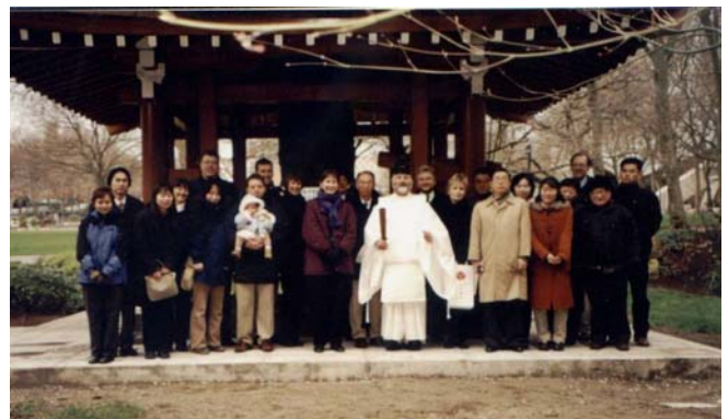
Members and friends of SKSCA gather after the bell rededication.